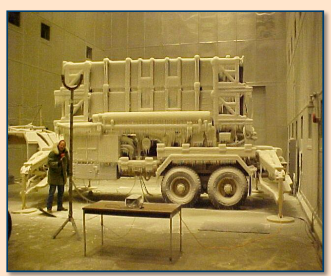
OPSEC Review Date: May 24, 2011 Approved for Public Release, Distribution unlimited

ETA supports the following types of testing: fungus, high temperature, rain, wind, sand/dust, and small item temperature, humidity, salt and fog testing. Multiple tests can be conducted simultaneously